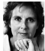
H.E. Ms. Connie Hedegaard Minister for the Environment

For further information please visit our home page at www.mim.dk or contact The Danish Ministry of the Environment at mim@mim.dk